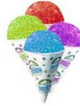
Snow Cones $4.00