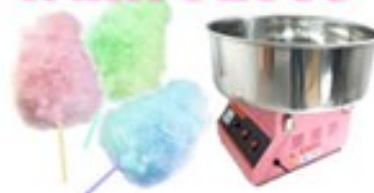
Fairy Floss $4.00