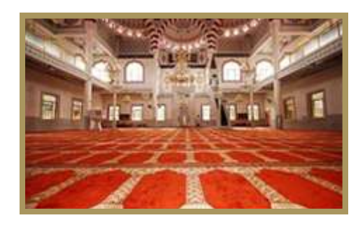
Turkish Gallipoli Mosque, Auburn